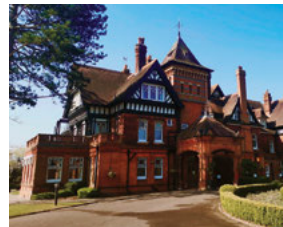
South Woodlands Park Hotel, Surrey