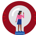
Top Five Things Every Director Should Know