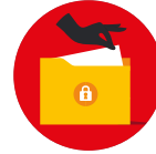
Managing Fraud Risk