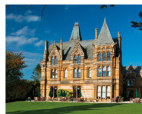
West Midlands Ettington Park Hotel, Warwickshire