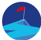
Practical Tips for Becoming a Non-Executive Director