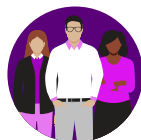
Fit for the Board: with the IoD's Director Competency Framework