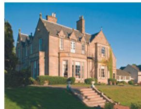
Scotland Norton House Hotel, Edinburgh