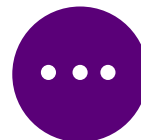
New courses on the way!