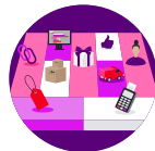
The Business Model Canvas