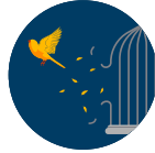
Anti Slavery Digital Learning