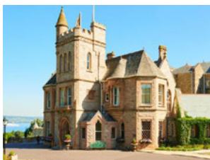
Northern Ireland Culloden Estate and Spa, Belfast