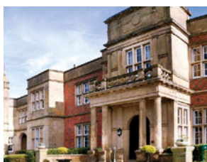
North West De Vere Cranage Estate, Cheshire