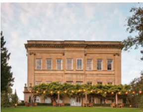
South West Bailbrook House Hotel, Bath