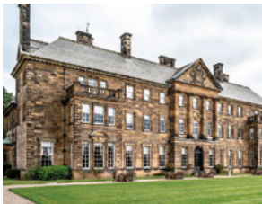
North East Crathorne Hall Hotel, Yarm

The five-day residential course offers directors with demanding schedules a faster way to upskill, and is a great solution for leadership teams seeking to develop a shared approach to governance, finance, strategy and leadership.