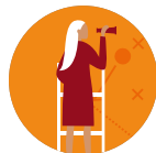
Strategic Decision Making